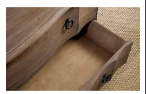
Drawer finished on bottom and sides