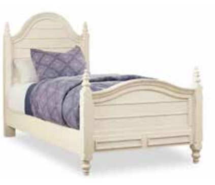
Wood Panel Bed

Rubberwood Solids; One drawer 30W \times 20D \times 29 \, 3/4H \, (76 \times 51 \times 76 \, cm) shown on page 9, 10