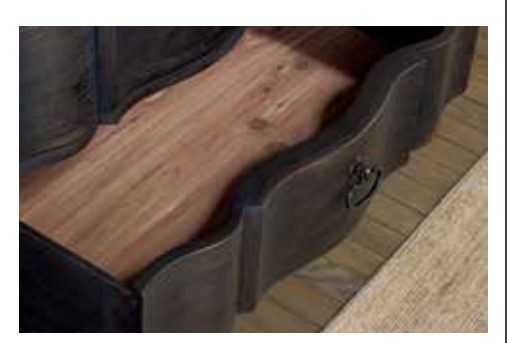
Detail of cedar-lined bottom drawer