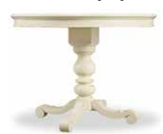
Table at counter height