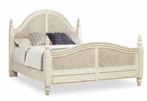
Woven Panel Bed Rubberwood Solids with Sea Grass

5900-90250-WH Woven Panel Bed 5/0, Queen 66W x 89 1/4D x 67 1/4H (168 x 227 x 171 cm)