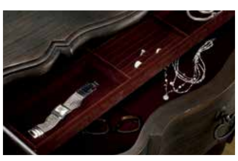
Detail of felt lined drawer