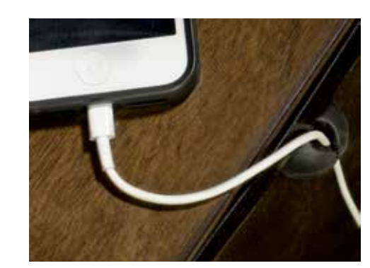
A convenient cord clip avoids one of life's little headaches by holding phone charging cords securely in place so they don't fall behind the nightstand.