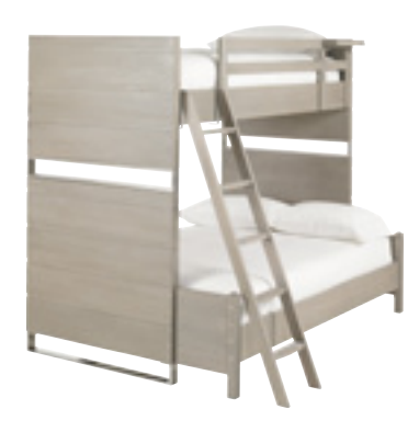
TWIN OVER FULL EXT KIT 6351590 / 56w x 81d x 72h Extension kit allows for a 4'-6" full sized mattress on the bottom bunk. Accommodates Trundle or Storage Unit.