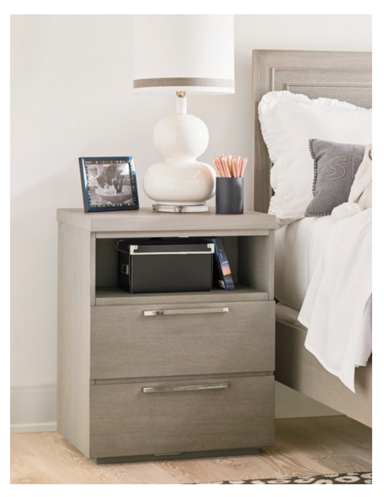
NIGHTSTAND 6351080 / 22w x 18d x 28h