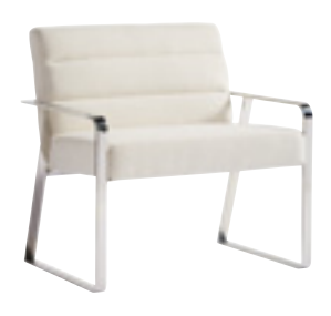
STUDY BUDDY CHAIR 6351070 / 34w x 26d x 35h Shown on pages: 6, 8, 13, 16, 18