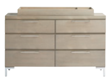
CHANGING STATION 6351200 / 43w x 18d x 5h Shown with 6351002 Dresser. Shown on page: 23