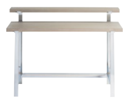
DESK 6351027 / 52w x 23d x 37h Shown on pages: 16, 18