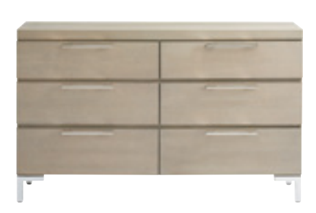
DRAWER DRESSER 6351002 / 56w x 18d x 34h Six drawers. Features Smart Stop Drawer System. Shown on pages: 4, 12, 23