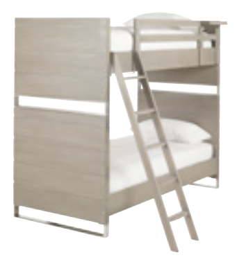
BUNK BED 6351530 / Twin / 42w x 81d x 72h Shown on page: 7