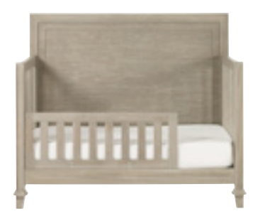
TODDLER BED CONVERSION KIT 6351305 / 58w x 3d x 33h Kit works with convertible crib to create Toddler or Day Bed. Shown on page: 23