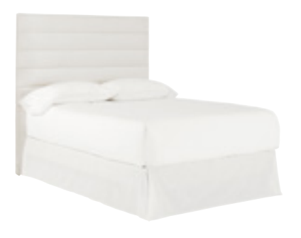
UPHOLSTERED BED (headboard only) 6351138 / 3/3 Twin 44w x 3d x 55h 6351143 / 4/6 Full 58w x 3d x 60h Requires use of bed frame, not supplied. Shown on page: 8