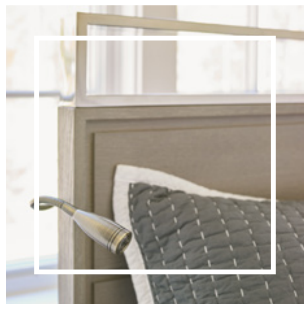
Built-in lighting is strategically placed