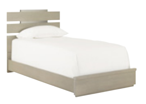
PANEL BED 6351036 / 3/3 Twin 43w x 81d x 43h 6351041 / 4/6 Full 58w x 81d x 43h (footboard height is 11") Does not accept under bed storage. Shown on pages: 10, 20