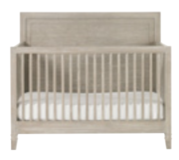
CONVERTIBLE CRIB 6351310 / 56w x 31d x 48h Shown on page: 22