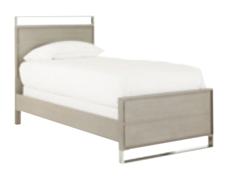
READING BED 6351035 / 3/3 Twin 41w x 81d x 48h 6351040 / 4/6 Full 56w x 81d x 48h LED flex reading light in headboard. (footboard height is 22") Shown on pages: 4, 18