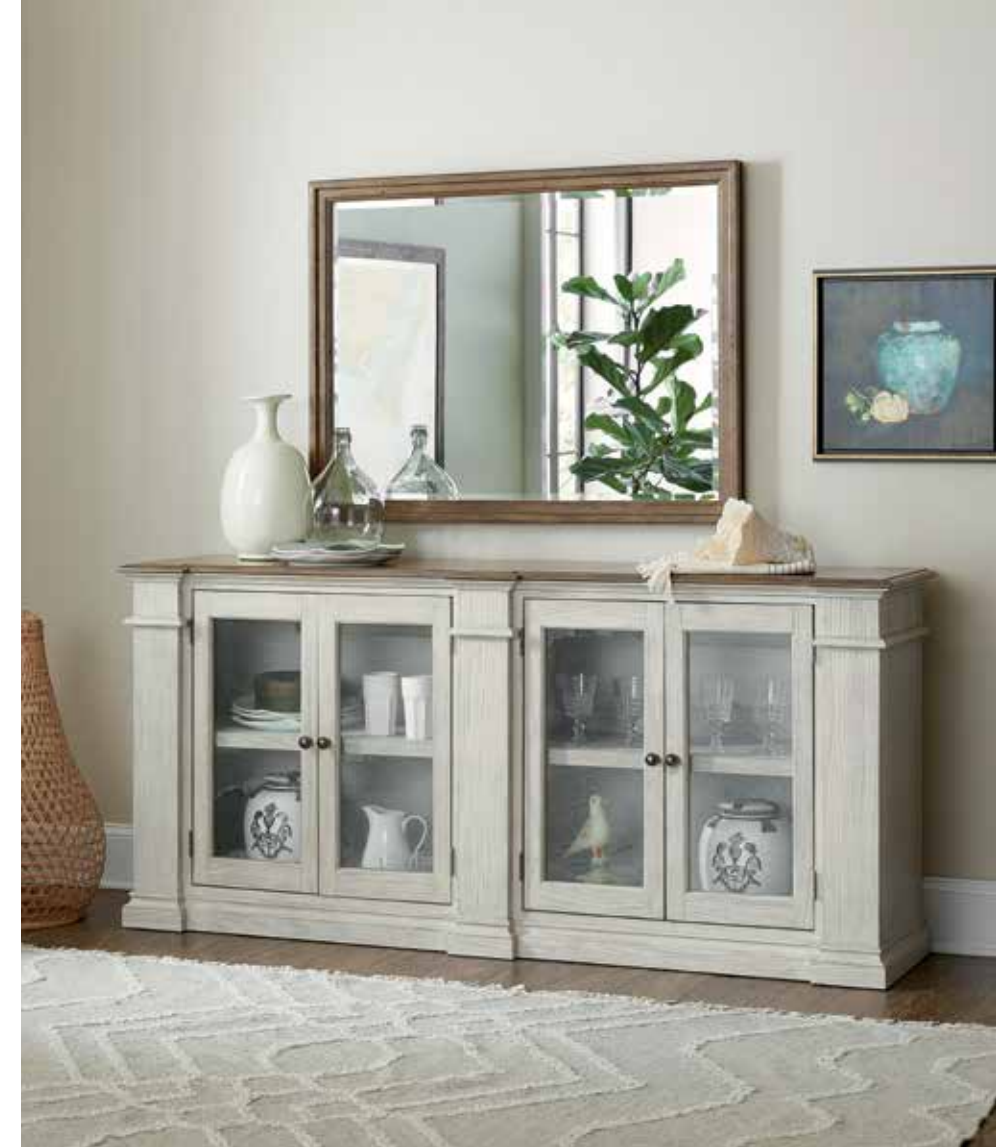
6101-75900-02 Buffet 76W x 18D x 36H