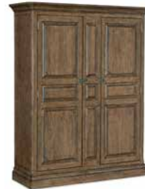
6102-90013-80 Master Chest Alder Solid Wood; Carob Brown finish; Two doors, three adjustable shelves behind each door, one removable hanging bar behind each door at the top 54W x 22D x 69H (137 x 56 x 175 cm) shown on page: 11, 12, 13