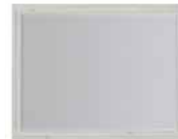
6101-90004-02 Mirror Poplar Solid Wood and Mirror; Danish White finish; Beveled mirror 45W x 2D x 35H (114 x 5 x 89 cm) shown on page: 22