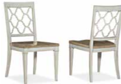
6101-75310-02 Wood Seat Side Chair Rubberwood and Alder Solid Wood; Danish White and Carob Brown finishes; Contrasting wood finish on seat 20W x 24D x 38H (51 x 61 x 97 cm) shown on page: 4, 5, 24