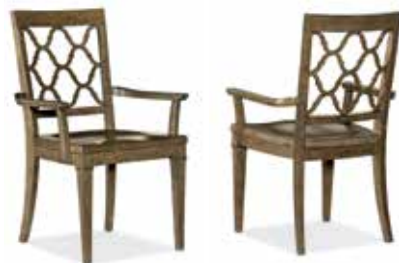
6102-75300-80 Wood Seat Arm Chair Alder Solid Wood; Carob Brown finish 24 1/4W x 24D x 38H (62 x 61 x 97 cm) shown on page: 2, 3, 6, 7, 8, 9