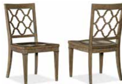
6102-75310-80 Wood Seat Side Chair Alder Solid Wood; Carob Brown finish 24 1/4W x 24D x 38H (62 x 61 x 97 cm) shown on page: 2, 3, 6, 7, 8, 9