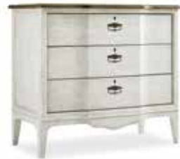
6101-90017-02 Bachelor's Chest Poplar Solid Wood; Danish White and Carob Brown finishes; Three drawers with self-closing undermount drawer guides, breakfront shape 36W x 18D x 32H (91 x 46 x 81 cm) shown on page: 18, 22