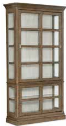
6102-75906-80 Sliding Door Display Cabinet Alder Solid Wood; Carob Brown and Danish White finishes; Four wood-framed glass sliding doors, four adjustable wood-framed glass shelves, glass shelves have plate grooves, backpanel is reversible with Danish White finish on one side and Carob Brown finish on the other, puck light with touch switch on back of right end panel 48W x 17D x 88H (122 x 43 x 224 cm) shown on page: 2, 6, 7