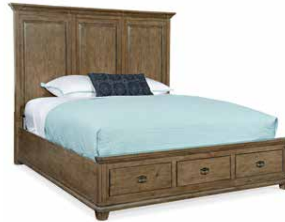
Wood Mansion Bed with Storage Footboard Poplar Solid Wood and Laminated Hardwood; Carob Brown finish