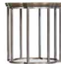
6102-80114-80 Round End Table Alder Solid Wood and Metal; Carob Brown finish 24W x 24D x 25H (61 x 61 x 64 cm) shown on page: 24