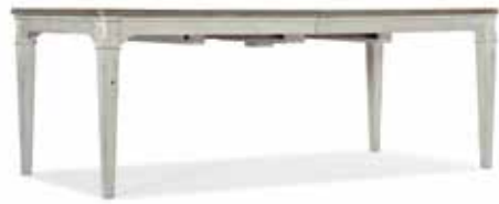
6101-75200-02 82-inch Rectangle Dining Table with One 20-inch Leaf Alder and Poplar Solid Wood; Danish White and Carob Brown finishes; One 20-inch leaf, table extends to 102-inches long with leaf in place 82W x 40D x 30H (208 x 102 x 76 cm) shown on page: 2