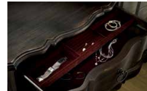
Detail of felt lined drawer