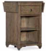
6102-90015-80 Telephone Table Alder Solid Wood; Carob Brown finish; One drawer with self-closing undermount drawer guides, one adjustable shelf 20W x 18D x 29 1/2H (51 x 46 x 75 cm) shown on page: 13