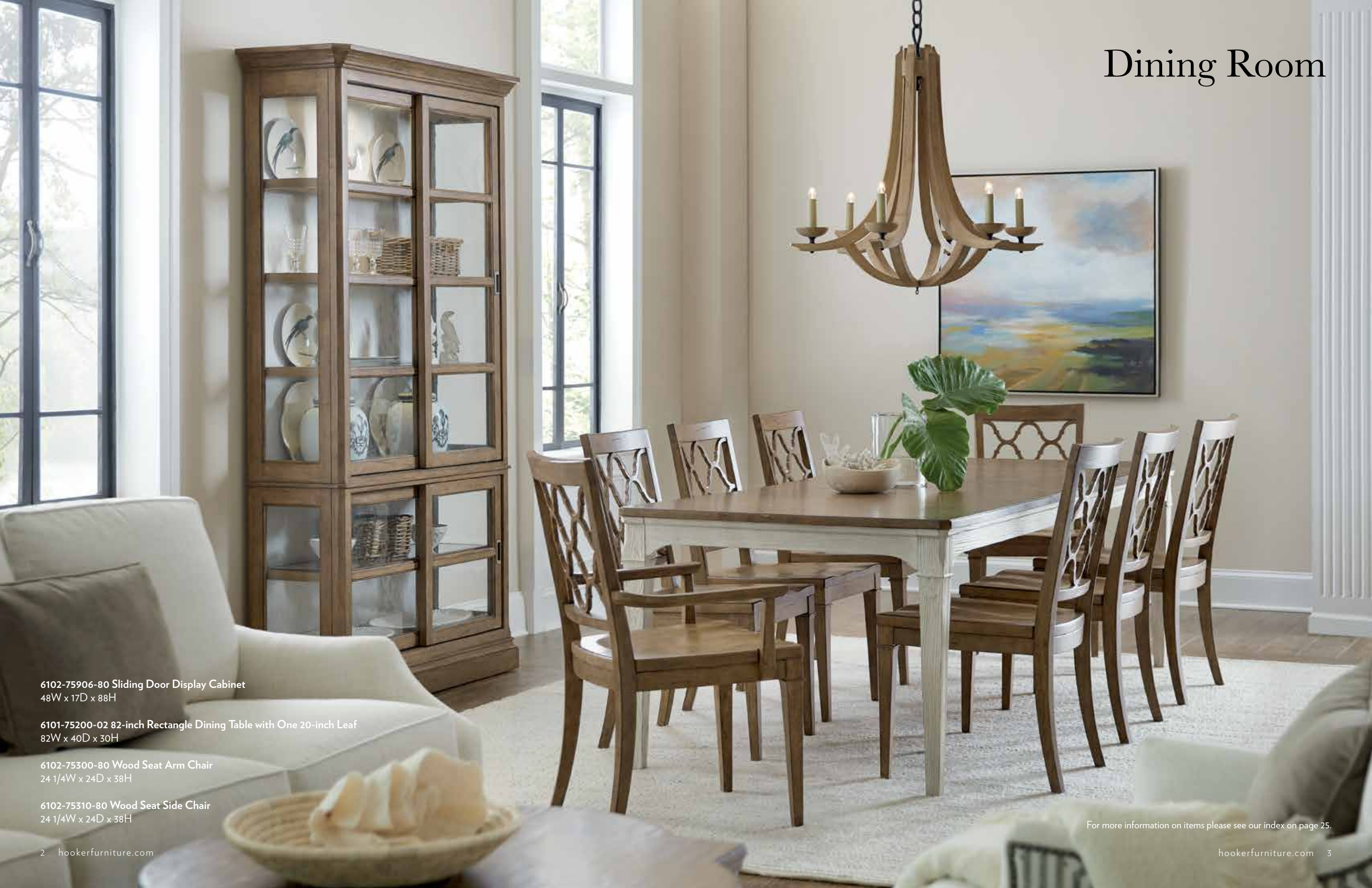
6102-75906-80 Sliding Door Display Cabinet 48W x 17D x 88H