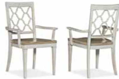
6101-75300-02 Wood Seat Arm Chair Rubberwood and Alder Solid Wood; Danish White and Carob Brown finishes; Contrasting wood finish on seat 24 1/4W x 24D x 38H (62 x 61 x 97 cm) shown on page: 4, 5