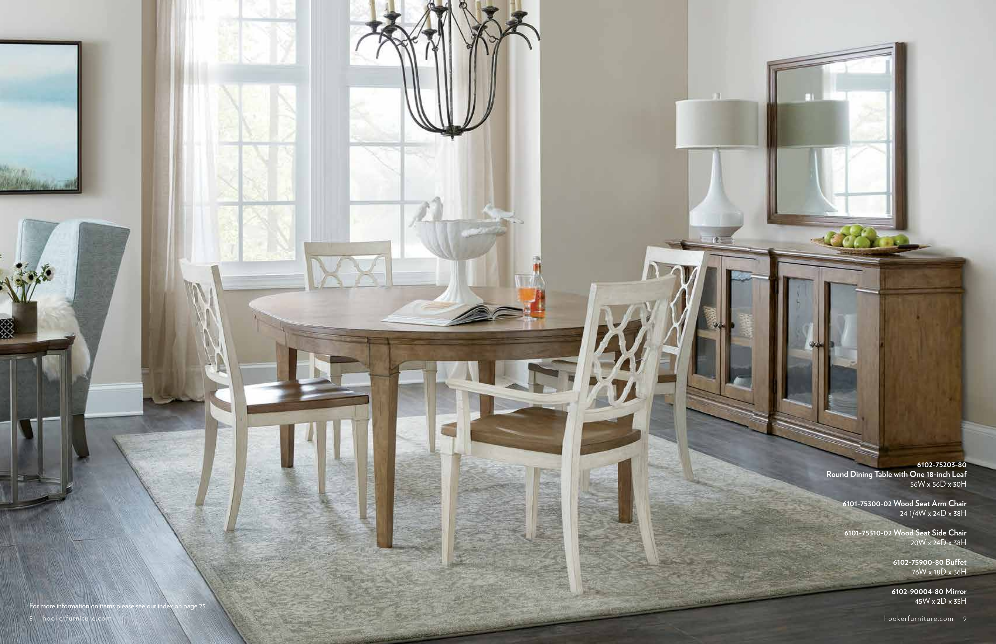
6102-75203-80 Round Dining Table with One 18-inch Leaf 56W x 56D x 30H