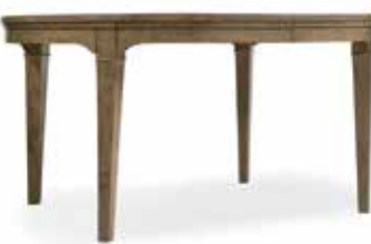
6102-75203-80 Round Dining Table with One 18-inch Leaf Alder Solid Wood; Carob Brown finish; One 18-inch leaf, table extends to 74-inches long 56W x 56D x 30H (142 x 142 x 76 cm) shown on page: 8, 9