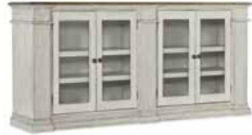
6101-75900-02 Buffet Alder and Poplar Solid Wood; Danish White and Carob Brown finishes; Four doors, doors have interchangeable glass or wood inserts, two adjustable shelves behind each set of doors, ventilated back panel, FC705 three plug electrical outlet 76W x 18D x 36H (193 x 46 x 91 cm) shown on page: 5