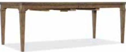
6102-75200-80 82-inch Rectangle Dining Table with One 20-inch Leaf Alder Solid Wood; Carob Brown finish; One 20-inch leaf, table extends to 102-inches long with leaf in place 82W x 40D x 30H (208 x 102 x 76 cm) shown on page: 6, 7