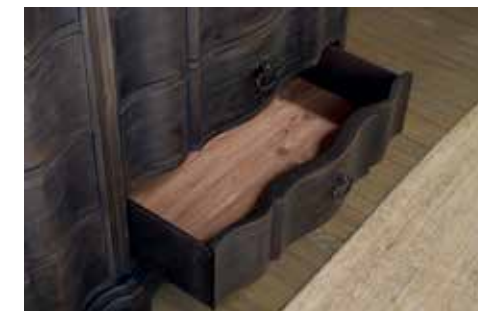
Detail of cedar-lined bottom drawer