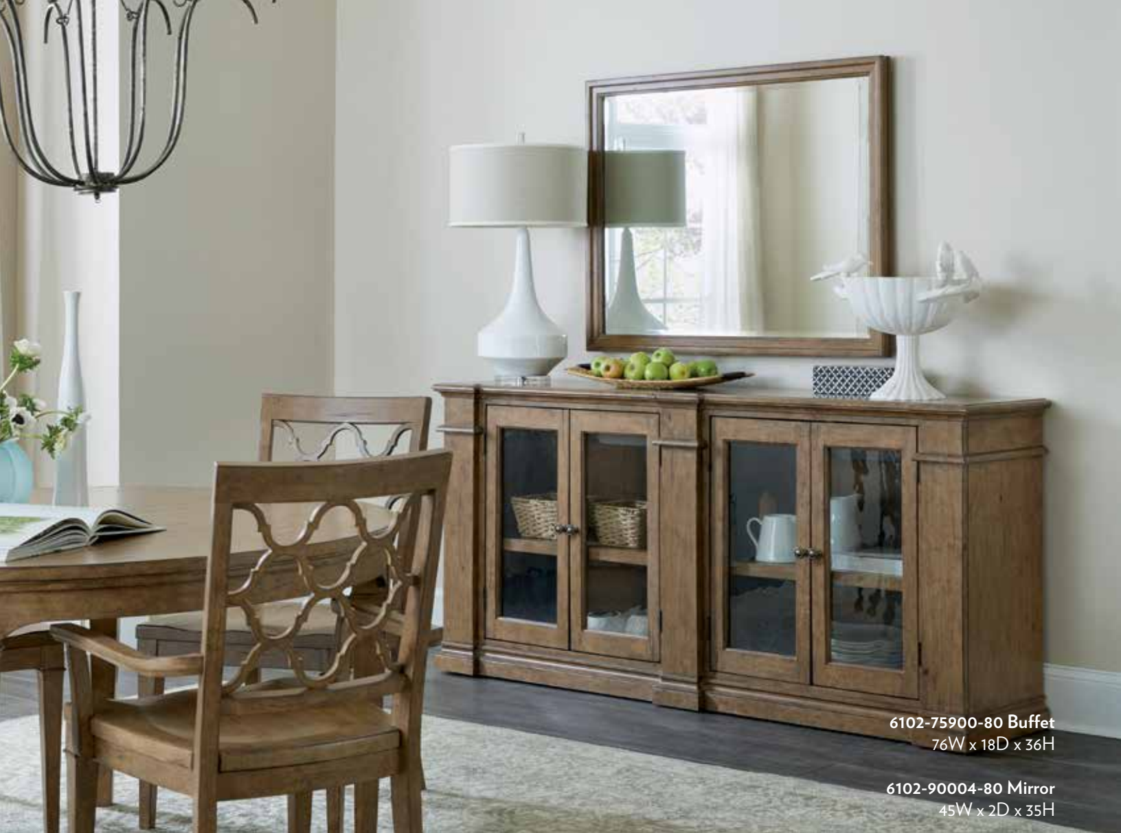
6102-75900-80 Buffet 76W x 18D x 36H