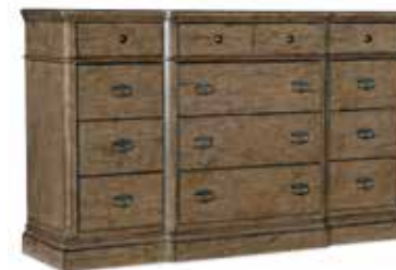
6102-90002-80 Twelve-Drawer Dresser Alder Solid Wood; Carob Brown finish Twelve drawers with self-closing undermounted drawer guides, drop-in felt liner in top drawers, removable felt liner in one top drawer, cedar-lined bottom drawers 66W x 19 1/2D x 40H (168 x 50 x 102 cm) shown on page: 15, 17