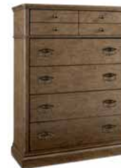
6102-90010-80 Five-Drawer Chest Alder Solid Wood; Carob Brown finish; Five drawers with self-closing undermounted drawer guides, drop-in felt liner in top drawer, cedar-lined bottom drawer 42W x 18 1/2D x 58H (107 x 47 x 147 cm) shown on page: 16