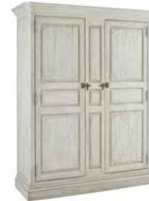
6101-90013-02 Master Chest Poplar Solid Wood; Danish White finish; Two doors, three adjustable shelves behind each door, one removable hanging bar behind each door at the top 54W x 22D x 69H (137 x 56 x 175 cm) shown on page: 19, 20, 21