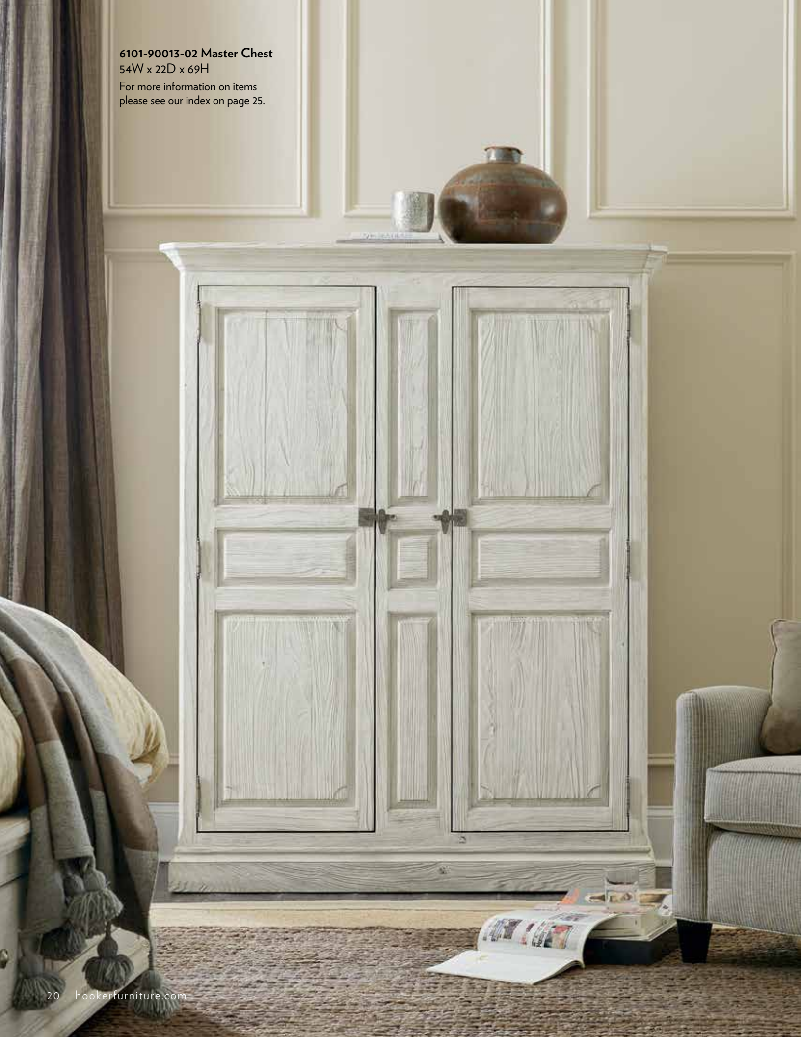
6101-90013-02 Master Chest 54W x 22D x 69H For more information on items please see our index on page 25.