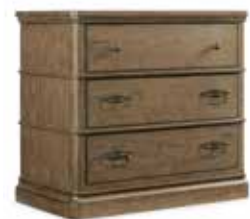
6102-90016-80 Three-Drawer Nightstand Alder Solid Wood; Carob Brown finish; Three drawers with self-closing undermount drawer guides 32W x 18 1/2D x 29 1/2H (81 x 47 x 75 cm) shown on page: 17