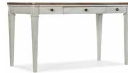
6101-10458-02 Writing Desk Alder and Poplar Solid Wood; Danish White and Carob Brown finishes; Three drawers with self-closing undermounted drawer guides, center drawer has drop-front for keyboard 56W x 28D x 31H (142 x 71 x 79 cm) shown on page: