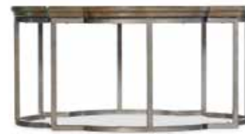
6102-80110-80 Round Cocktail Table Alder Solid Wood and Metal 38W x 38D x 18H (97 x 97 x 46 cm) shown on page: 24