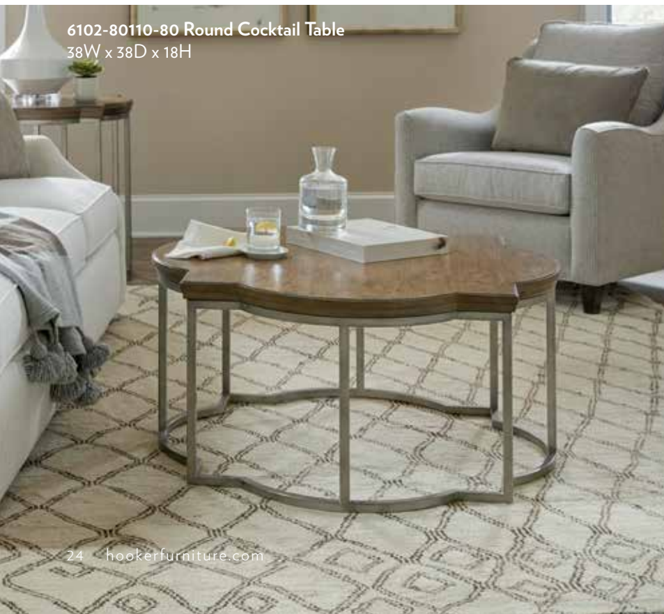
6102-80110-80 Round Cocktail Table 38W x 38D x 18H