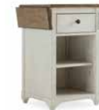
6101-90015-02 Telephone Table Alder and Poplar Solid Wood; Danish White and Carob Brown finishes; One drawer with self-closing undermount drawer guides, one adjustable shelf 20W x 18D x 29 1/2H (51 x 46 x 75 cm) shown on page: 21