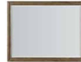
6102-90004-80 Mirror Alder Solid Wood and Mirror; Carob Brown finish 45W x 2D x 35H (114 x 5 x 89 cm) shown on page: 9, 15, 17