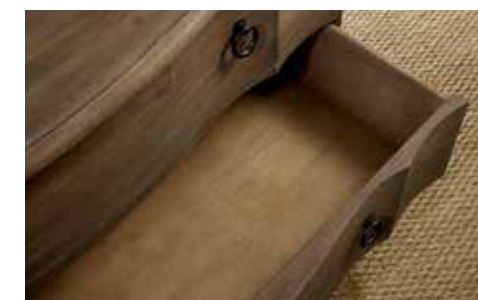
Drawer finished on bottom and sides