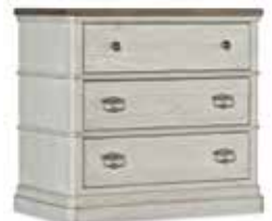
6101-90016-02 Three-Drawer Nightstand Alder and Poplar Solid Wood; Danish White and Carob Brown finishes Three drawers with self-closing undermount drawer guides 32W x 18 1/2D x 29 1/2H (81 x 47 x 75 cm) shown on page: 21, 23