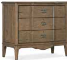
6102-90017-80 Bachelor's Chest Alder Solid Wood; Carob Brown finish Three drawers with self-closing undermount drawer guides, breakfront shape 36W x 18D x 32H (91 x 46 x 81 cm) shown on page: 10