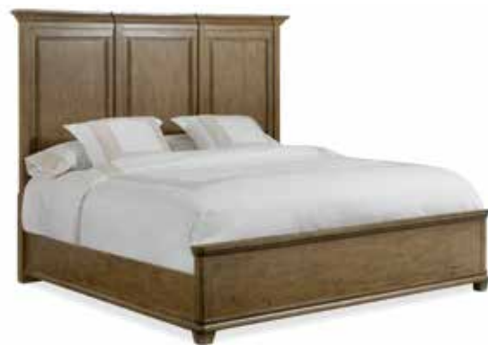
Wood Mansion Bed Poplar Solid Wood and Laminated Hardwood; Carob Brown finish; Headboard can also be used alone