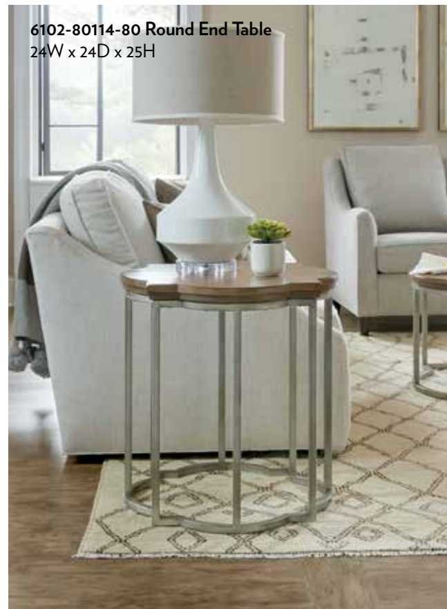
6102-80114-80 Round End Table 24W x 24D x 25H