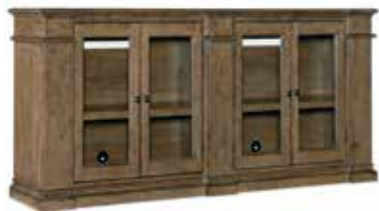
6102-75900-80 Buffet Alder Solid Wood; Carob Brown finish Four doors, doors have interchangeable glass or wood inserts, two adjustable shelves behind each set of doors, ventilated back panel, FC705 three plug electrical outlet 76W x 18D x 36H (193 x 46 x 91 cm) shown on page: 9, back cover