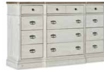
6101-90002-02 Twelve-Drawer Dresser Alder and Poplar Solid Wood; Danish White and Carob Brown finishes; Twelve drawers with self-closing undermounted drawer guides, drop-in felt liner in top drawers, removable felt liner in one top drawer, cedar-lined bottom drawers 66W x 19 1/2D x 40H (168 x 50 x 102 cm) shown on page: 22