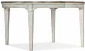
6101-75203-02 Round Dining Table with One 18-inch Leaf Alder and Poplar Solid Wood; Danish White and Carob Brown finishes; One 18-inch leaf, table extends to 74-inches long 56W x 56D x 30H (142 x 142 x 76 cm) shown on page: 4, 5