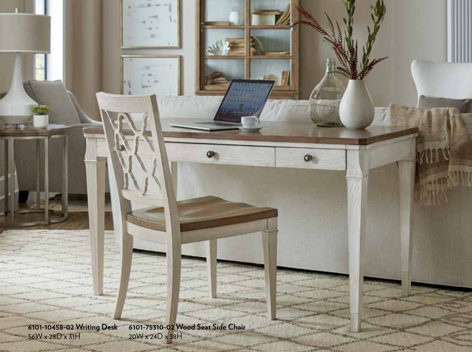
6101-10458-02 Writing Desk 56W x 28D x 31H 6101-75310-02 Wood Seat Side Chair 20W x 24D x 38H