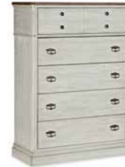
6101-90010-02 Five-Drawer Chest Alder and Poplar Solid Wood Danish White and Carob Brown finishes; Five drawers with self-closing undermounted drawer guides, drop-in felt liner in top drawer, cedar-lined bottom drawer 42W x 18 1/2D x 58H (107 x 47 x 147 cm) shown on page: 22