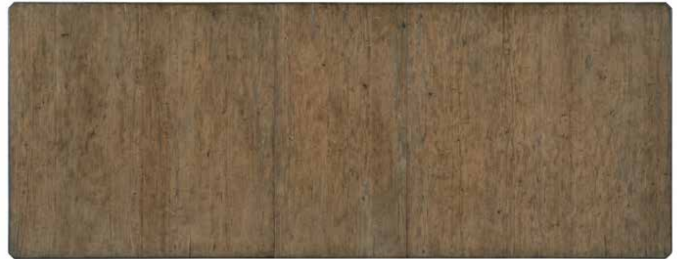
Top View of 6101-75200-02 82-inch Rectangle Dining Table with One 20-inch Leaf and 6102-75200-80 82-inch Rectangle Dining Table with One 20-inch Leaf