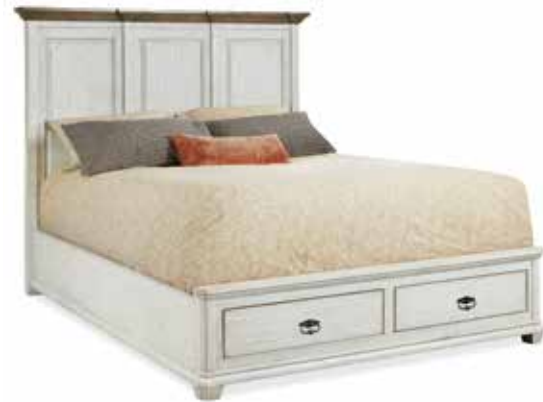
Wood Mansion Bed with Storage Footboard Poplar Solid Wood and Laminated Hardwood; Danish White and Carob Brown finishes; Headboard can also be used alone