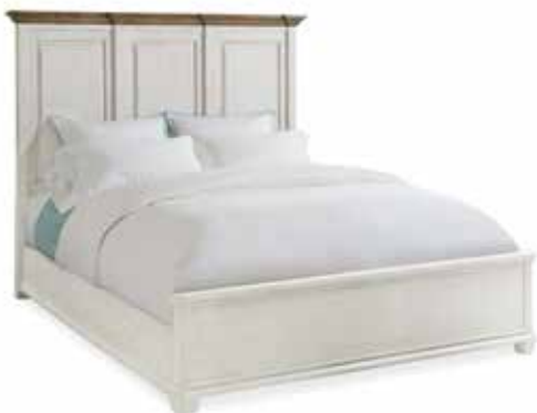
Wood Mansion Bed Poplar Solid Wood and Laminated Hardwood; Danish White and Carob Brown finishes; Headboard can also be used alone