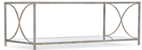
5940-80210-00 Wavecrest Metal and Glass Cocktail Table Metal and Glass; Champagne silver and gold with white and gray hangup on the metal frame with reverse handpainted glass in blue and champagne gold spatter; Levelers, one shelf 52W x 28D x 19H (132 x 71 x 48 cm) shown on page: 14, 15