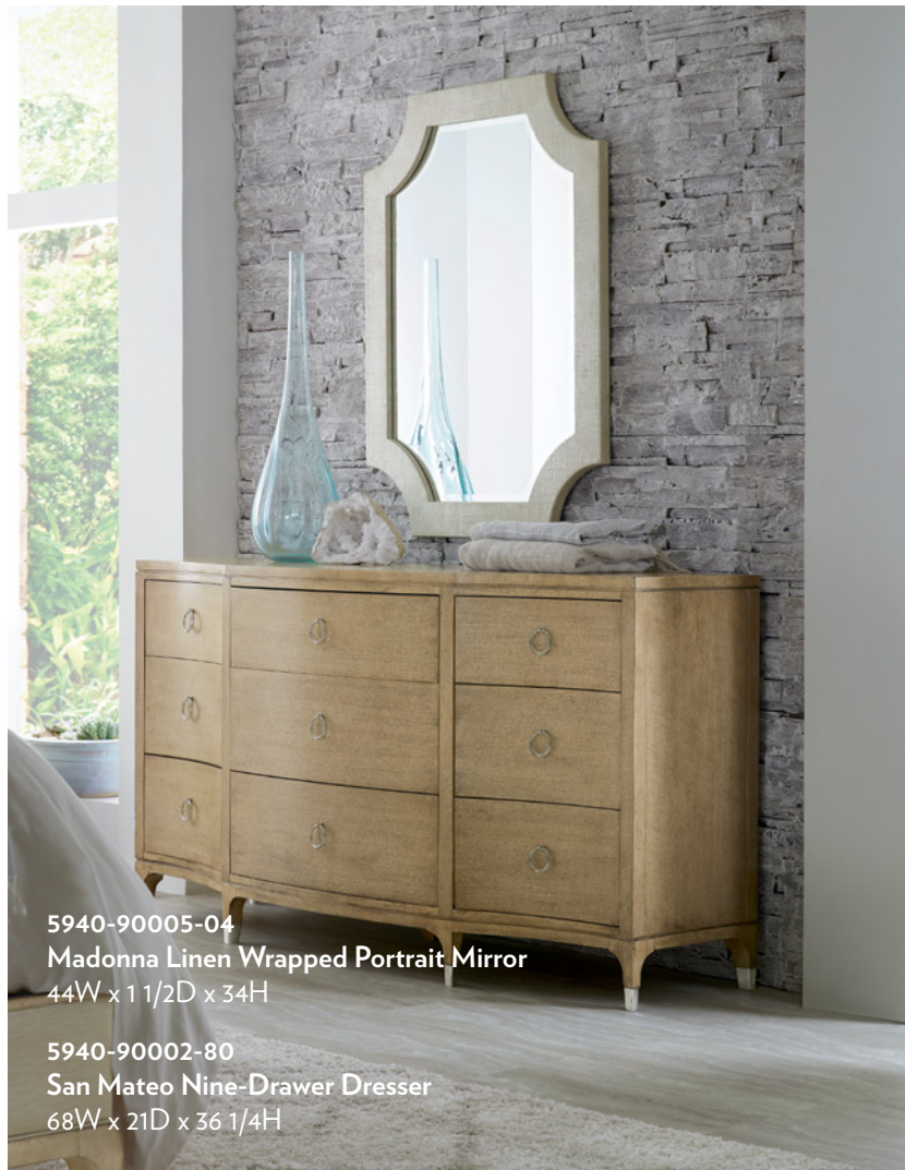
5940-90005-04 Madonna Linen Wrapped Portrait Mirror 44W x 11 1/2D x 34H