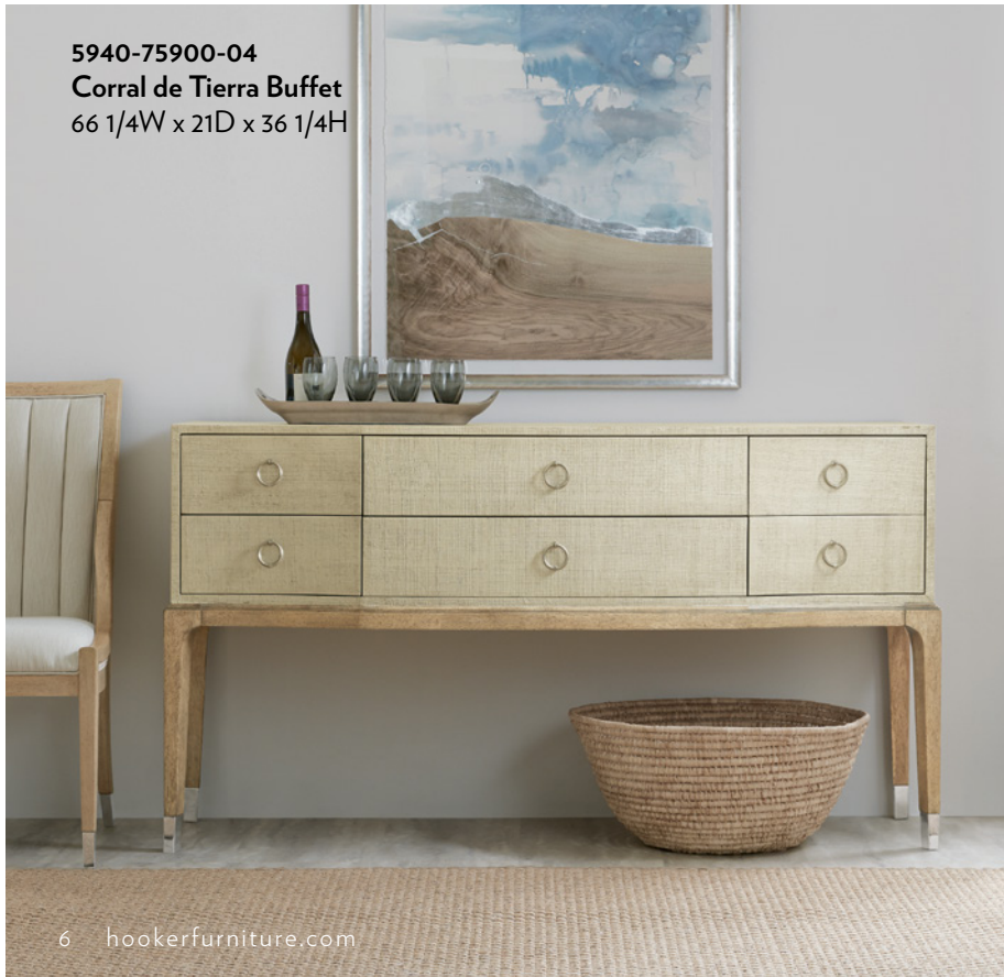
5940-75900-04 Corral de Tierra Buffet 66 1/4W x 21D x 36 1/4H