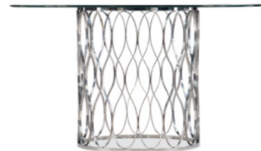
5940-75203B-00 Pillar Point Round Dining Table Base Metal; Satin Stainless; Levelers, must be used with glass top, glass tops are sold separately 26Dia. x 29 1/2H (66 x 66 x 75 cm) shown on page: 4, 5