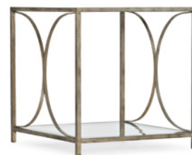
5940-80213-00 Wavecrest Metal and Glass End Table Metal and Glass; Champagne silver and gold with white and gray hangup on the metal frame with reverse handpainted glass in blue and champagne gold spatter Levelers, one shelf 26W x 24D x 25H (66 x 61 x 64 cm) shown on page: 14, 16