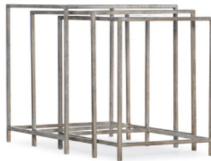
5940-50005-00 Wavecrest Metal & Glass Nesting Tables Metal and Glass; Champagne silver and gold with white and gray hangup on the metal frame with reverse handpainted glass in blue and champagne gold spatter; Levelers, three tables of varying heights that nest into each other 24W x 22D x 25H (61 x 56 x 64 cm) shown on page: 16