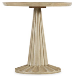
5940-50004-05 Pompnio Round Accent Table Rubberwood and Hardwood Solids with Bleached Quartered Figured Black Walnut Veneers and Resin; French Vanilla finish; levelers 24 Dia. x 24H (61 x 61 x 61 cm) shown on page: 16