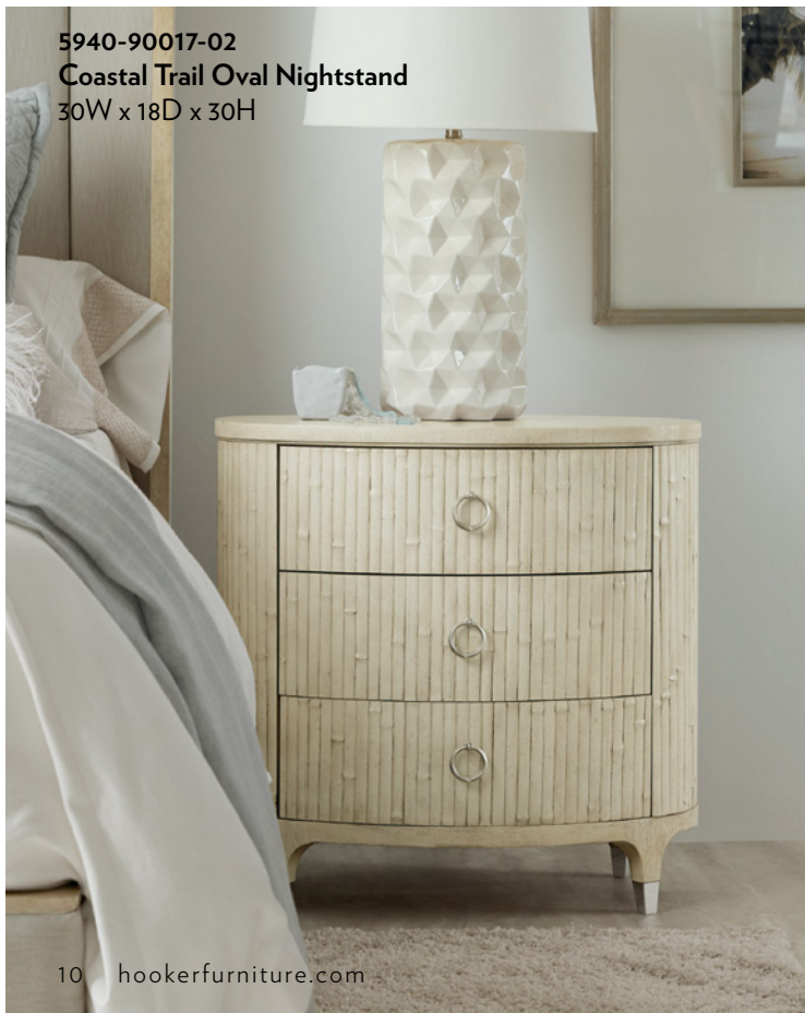
5940-90017-02 Coastal Trail Oval Nightstand 30W x 18D x 30H