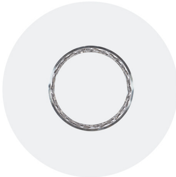
Top View of 5940-75203B-00 Pillar Point Round Dining Table