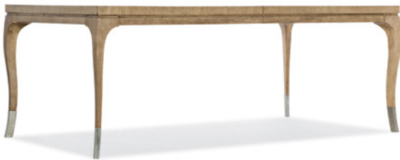
5940-75200-80 Lobitos Rectangle Table with One 20-inch Leaf Rubberwood and Hardwood Solids with Bleached Quartered Figured Black Walnut Veneers, Solid Wood Edged Top and Metal Ferrules; Sunsplash finish and Satin Stainless; One 20-inch leaf extends table to 122-inches long, with leaf, the table will accommodate 2 arms and 6 side chairs, without leaf, the table will accommodate 2 arms and 4 side chairs, metal ferrules on legs 102W x 43D x 30H (259 x 109 x 76 cm) shown on page: 2, 3