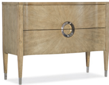
5940-50002-80 Harbor View Accent Chest Rubberwood and Hardwood Solids with Bleached Quartered Figured Black Walnut Veneers with White Oak Veneers and Metal Ferrules; Sunsplash finish and Satin Stainless; Two drawers with side mount metal guides, levelers, metal ferrules on legs 47 3/4W x 19 1/4D x 36H (121 x 49 x 91 cm) shown on page: 14, back cover