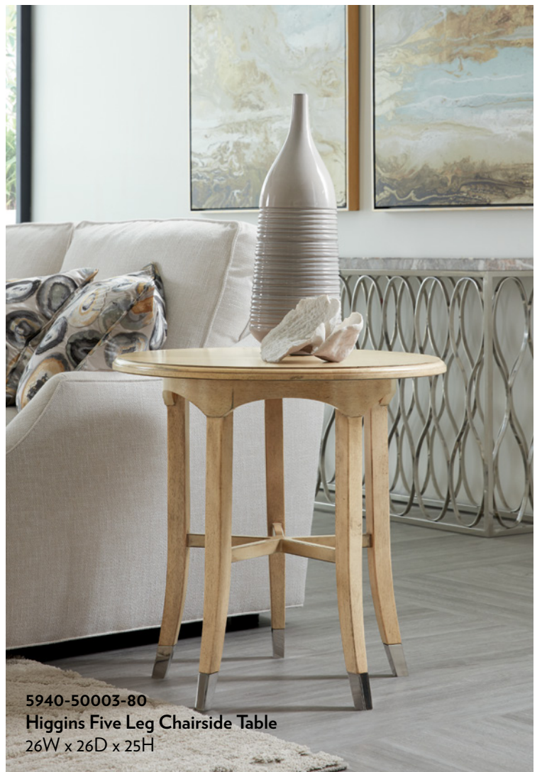
5940-50003-80 Higgins Five Leg Chairside Table 26W x 26D x 25H