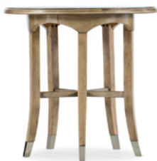
5940-50003-80 Higgins Five Leg Chairside Table Rubberwood and Hardwood Solids with Bleached Quartered Figured Black Walnut Veneers and Metal Ferrules; Sunsplash finish and Satin Stainless; Levelers, metal ferrules on all legs 26W x 26D x 25H (66 x 66 x 64 cm) shown on page: 13