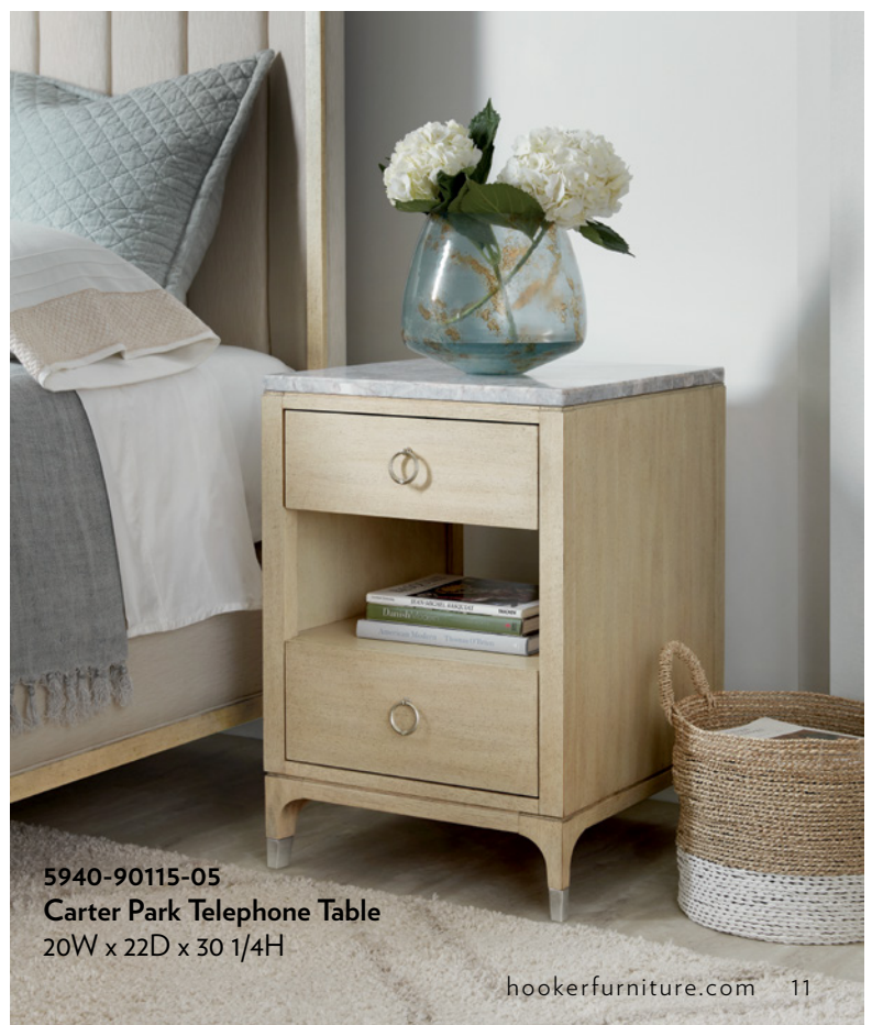
5940-90115-05 Carter Park Telephone Table 20W x 22D x 30 1/4H