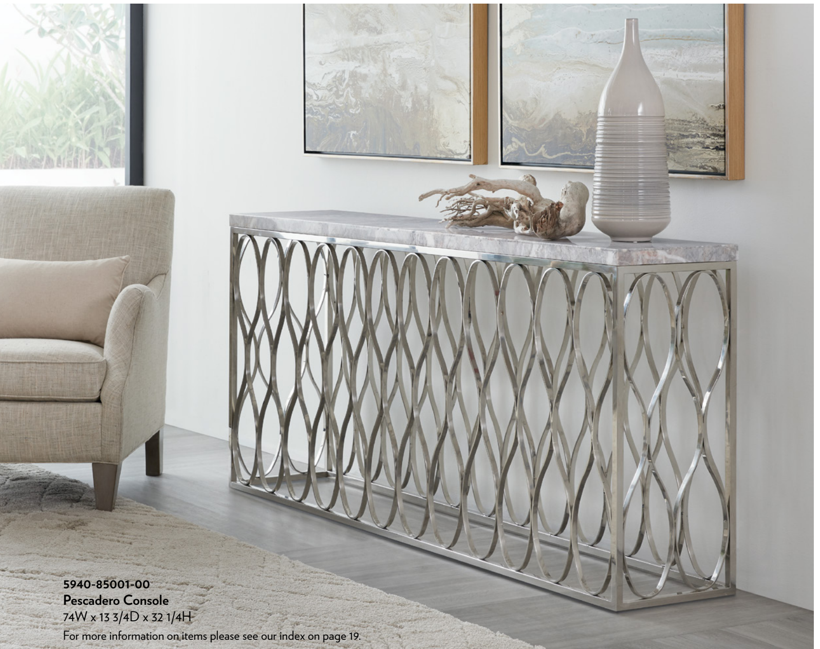
5940-85001-00 Pescadero Console 74W x 13 3/4D x 32 1/4H

For more information on items please see our index on page 19.