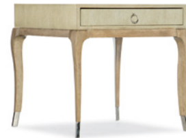
5940-80113-05 Cabrillo Rectangle End Table Rubberwood and Hardwood Solids with Bleached Quartered Figured Black Walnut and White Oak Veneers and Metal Ferrules French Vanilla finish on Raffia in top section, Sunsplash finish on legs, Satin Stainless metal ferrules; One drawer with self-closing undermount drawer guides, levelers, metal ferrules on legs 24W x 27D x 25 1/4H (61 x 69 x 64 cm) shown on page: 13, 16