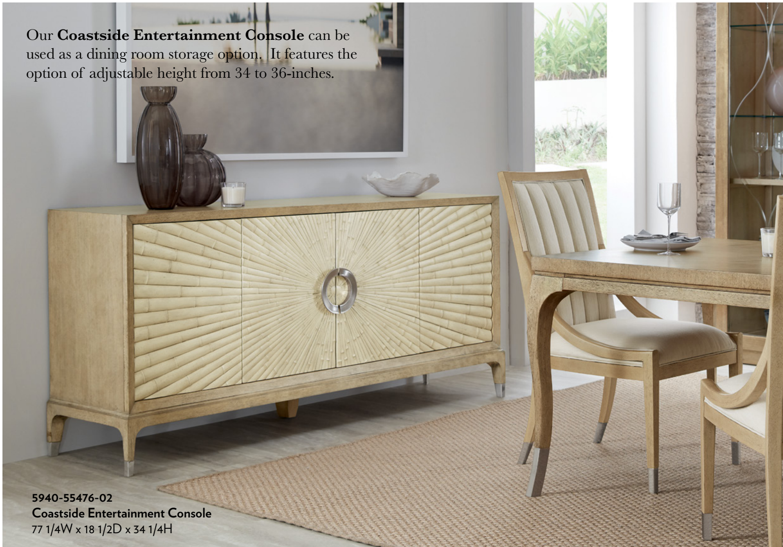
5940-55476-02 Coastside Entertainment Console 77 1/4W x 18 1/2D x 34 1/4H

Our Coastside Entertainment Console can be used as a dining room storage option. It features the option of adjustable height from 34 to 36-inches.