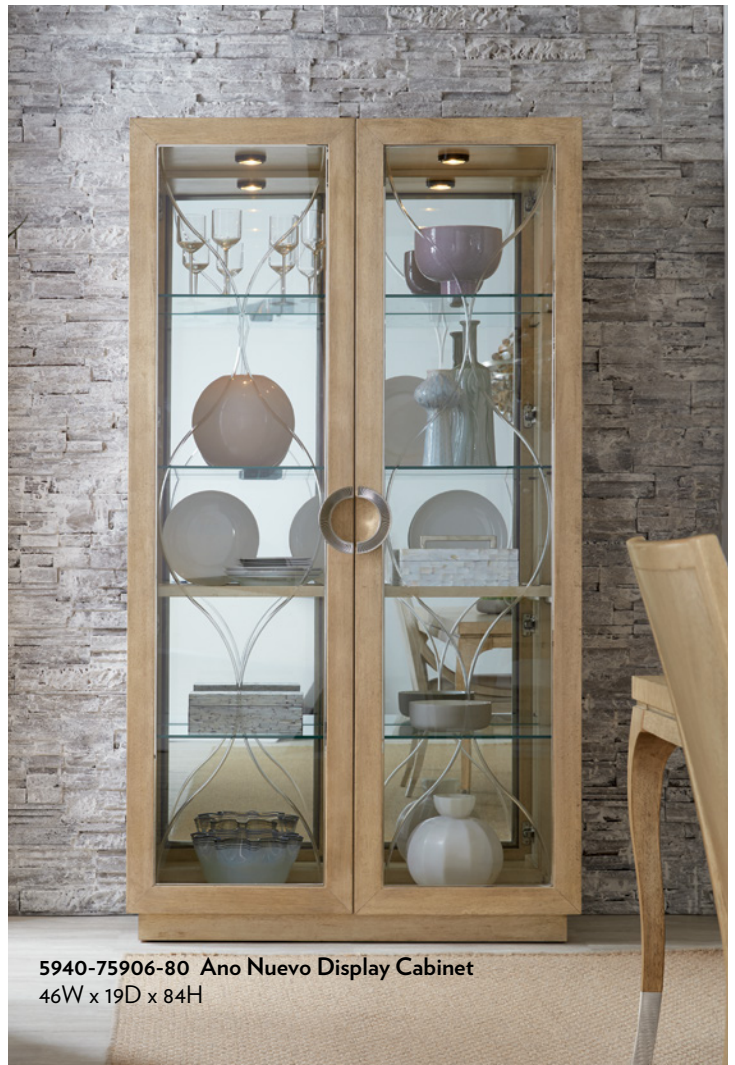
5940-75906-80 Ano Nuevo Display Cabinet 46W x 19D x 84H

For more information on items please see our index on page 19.