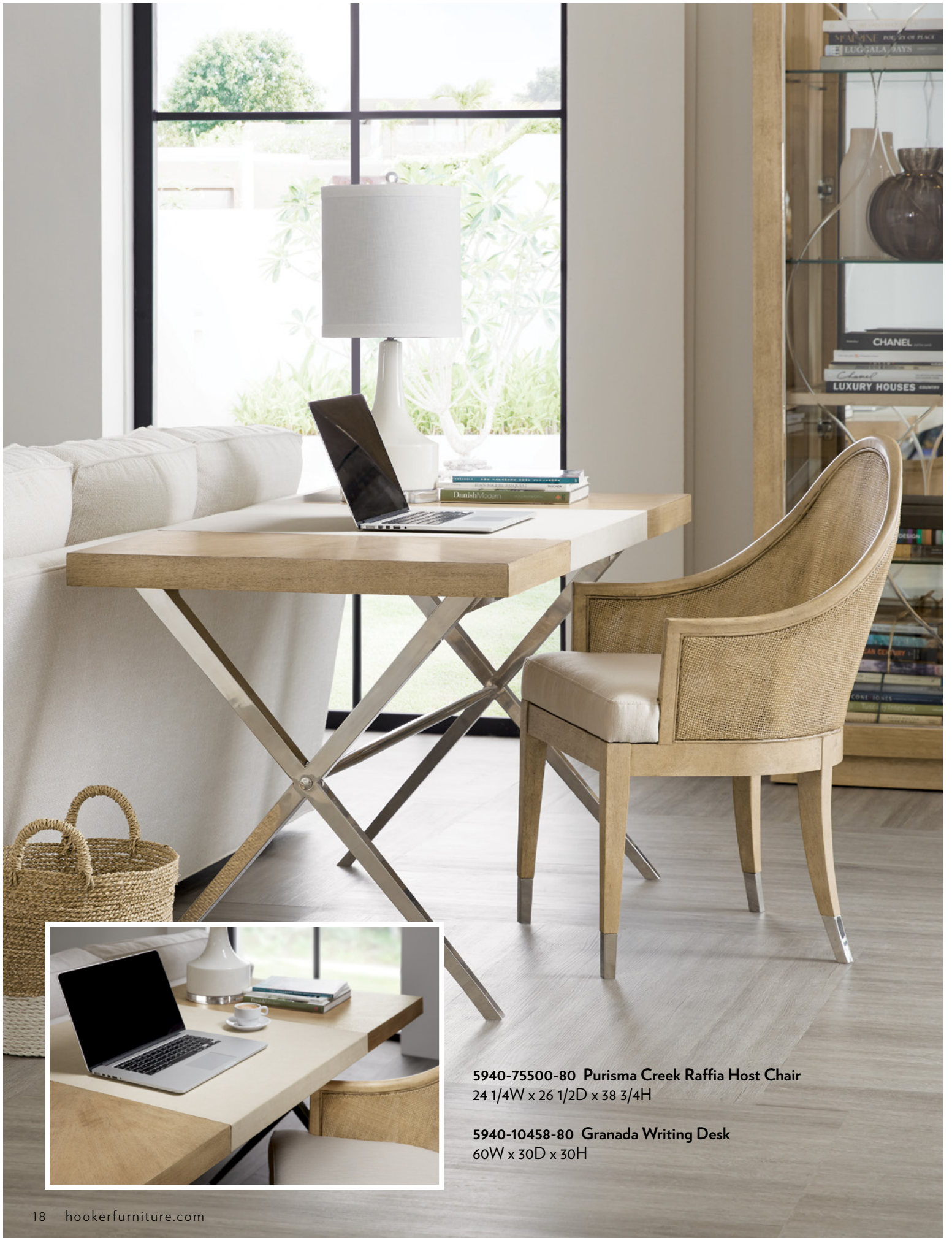
5940-75500-80 Purisma Creek Raffia Host Chair 24 1/4W x 26 1/2D x 38 3/4H