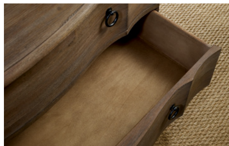
Drawer finished on bottom and sides