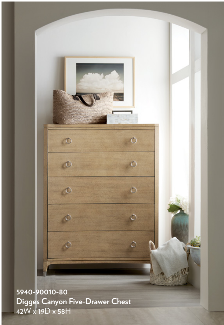
5940-90010-80 Digges Canyon Five-Drawer Chest 42W x 19D x 58H