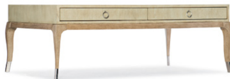
5940-80110-05 Cabrillo Rectangle Cocktail Table Rubberwood and Hardwood Solids with Bleached Quartered Figured Black Walnut and White Oak Veneers and Metal Ferrules; French Vanilla finish on Raffia in top section, Sunsplash finish on legs, Satin Stainless metal ferrules; Two drawers with self-closing undermount drawer guides, levelers, metal ferrules on legs 54W x 33D x 19 1/4H (137 x 84 x 49 cm) shown on page: 12