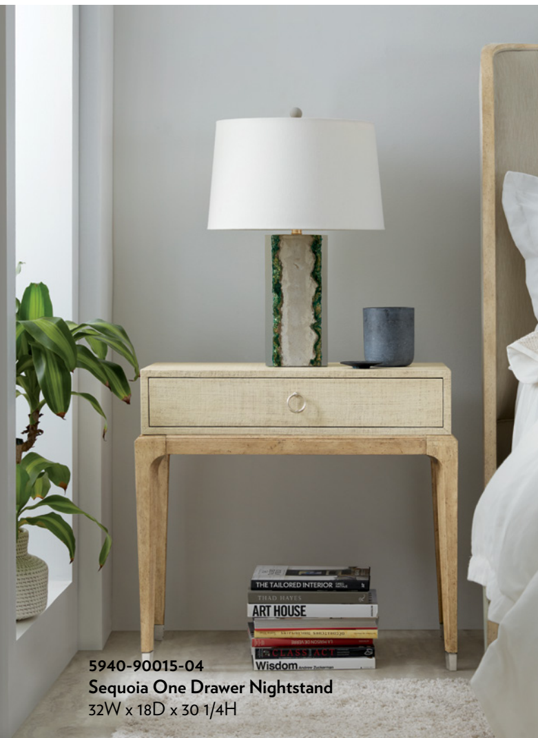
5940-90015-04 Sequoia One Drawer Nightstand 32W x 18D x 30 1/4H