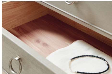
Detail of cedar-lined bottom drawer