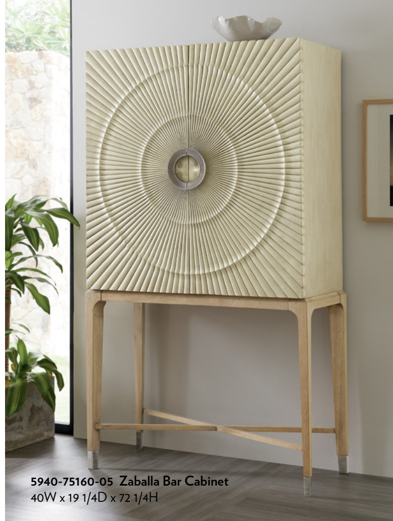
5940-75160-05 Zaballa Bar Cabinet 40W x 19 1/4D x 72 1/4H