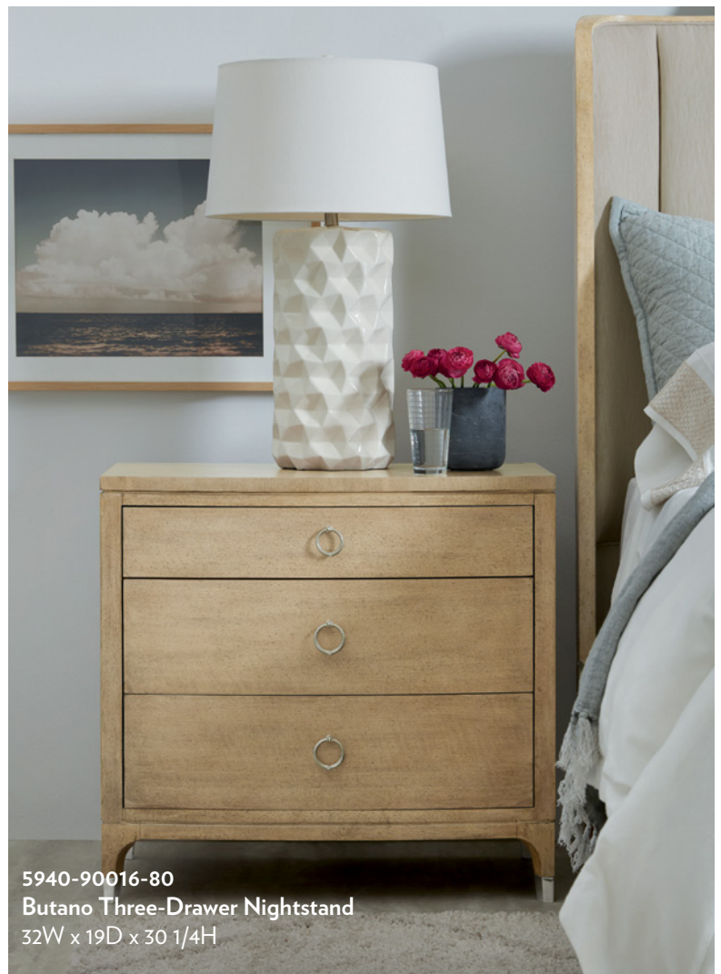
5940-90016-80 Butano Three-Drawer Nightstand 32W x 19D x 30 1/4H