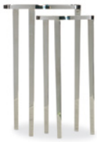
5940-50001-00 Ocean Shore Bunching Spot Table Metal with Antique Mirror and Stone; Satin Stainless metal finish; Levelers, polished steel base, antique mirror on the top of the large table, soap stone on the top of the small table 15W x 15D x 24H (38 x 38 x 61 cm) shown on page: 17