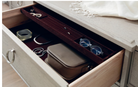
Detail of felt lined drawer