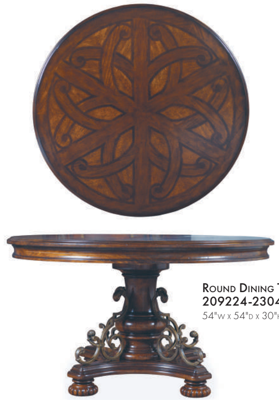
ROUND DINING TABLE 209224-2304 TP/BS 54"W x 54"D x 30"H