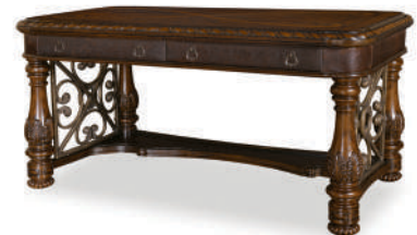
WRITING DESK 209421-2304 65 5 / 8 "w x 35 5 / 8 " d x 30 3 / 4 " H Pages 22,23