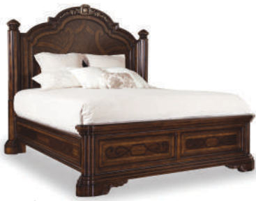
5/0 PANEL BED 209125-2304 5/0 HB 69"W x 6¾"D x 79 3 / 8 "H 5/0 FB 68 7 / 8 "W x 6¼"D x 24 3 / 8 "H 5/0-6/6 RS 81"W x 1¾"D x 12 5 / 8 "H