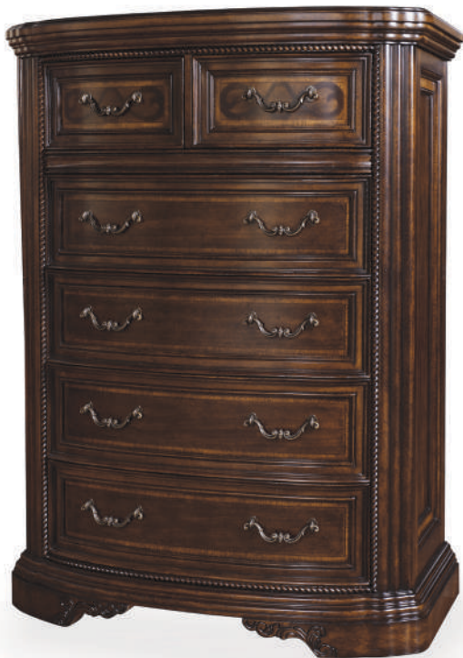
DRAWER CHEST 209150-2304 46"W x 22½"D x 60½"H