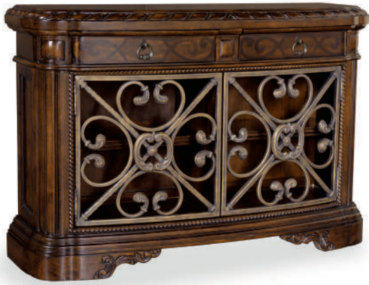
CONSOLE TABLE 209307-2304 52 \frac{1}{2} "W x 16"D x 34 \frac{5}{8} "H