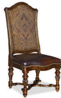
SIDE CHAIR 209204-2304 23¼"W x 27"D x 49"H