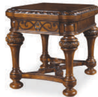
END TABLE 209303-2304 26" w x 31" d x 26" H Pages 2,18,20,21