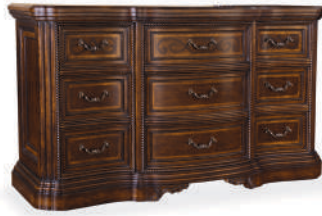
DRESSER 208130-2304 76"W x 23½"D x 41"H Pages 5,8,11