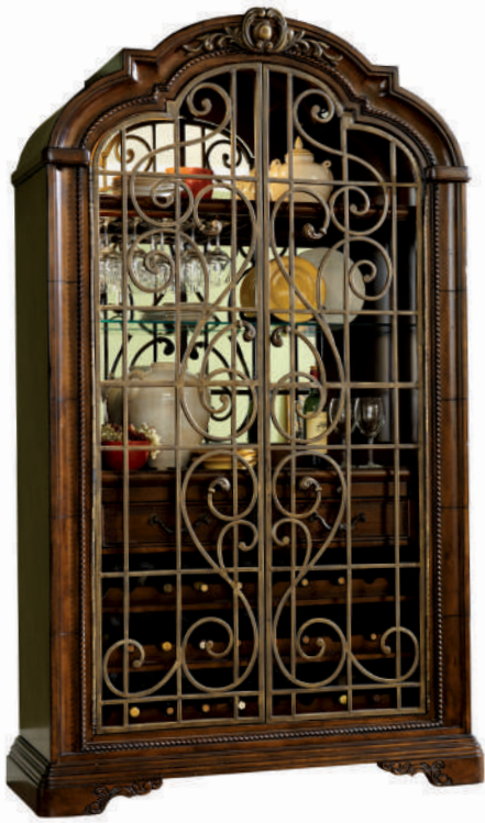
WINE CABINET 209242-2304 54½" w x 20⅝" d x 91⅞" h