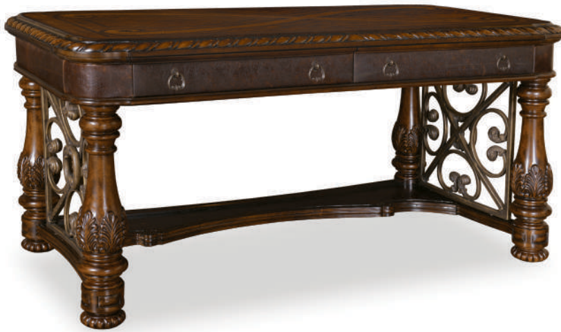
WRITING DESK 209421-2304 65 \frac{5}{8} "W x 35 \frac{5}{8} "D x 30 \frac{3}{4} "H