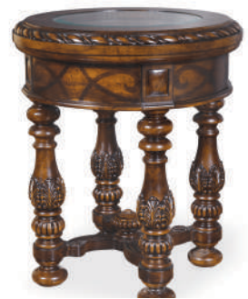
CHAIR SIDE TABLE 209310-2304 22"W x 22"D x 26"H