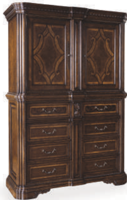
MASTER CHEST TOP 209152TP 65"W x 25"D x 42"H MASTER CHEST BASE 209152BS 63¼"W x 24"D x 50"H Pages 7