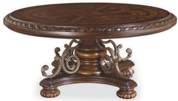
ROUND COCKTAIL TABLE 209302-2304 48"W x 48"D x 21 1/16"H