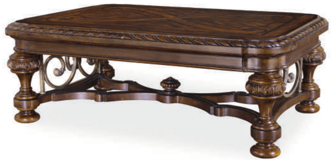
COCKTAIL TABLE 209300-2304 58"W x 38"D x 20"H