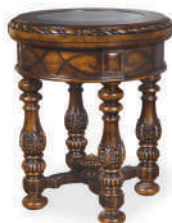
CHAIR SIDE TABLE 209310-2304 22" w x 22" d x 26" H Pages 19,21