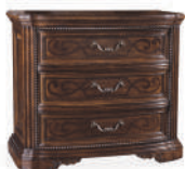
NIGHT STAND 209140-2304 37¼"W x 19"D x 32"H Pages 4,6,9