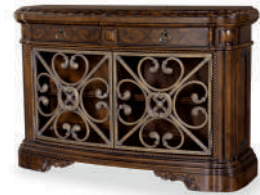
CONSOLE TABLE 209307-2304 52 1 / 2 "w x 16" d x 34 5 / 8 " H Pages 19,21,22