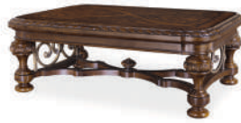
COCKTAIL TABLE 209300-2304 58" w x 38" d x 20" H Pages 2,20,21