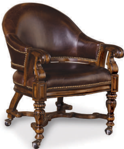
CASTER CHAIR 209216-2304 26 \frac{1}{8} "W x 28 \frac{3}{8} "D x 36"H