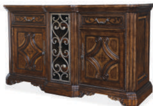
BUFFET 209251-2304 82" w x 24" d x 46" H Pages 12,13,16