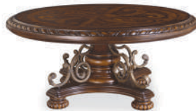
ROUND COCKTAIL TABLE 209302-2304 48" w x 48" d x 21 1 / 16 " H Pages 18,19,21,24