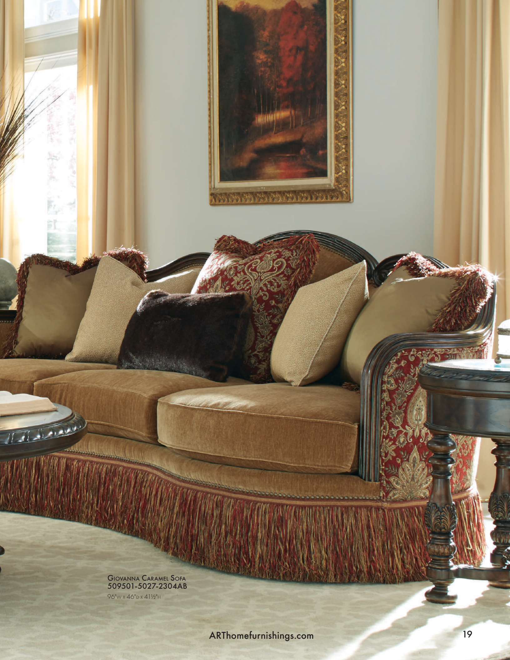
GIOVANNA CARAMEL SOFA 509501-5027-2304AB 96"W x 46"D x 41½"H