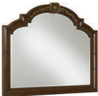
MIRROR 209121-2304 49 3 / 8 "W x 2 1 / 4 "D x 43"H Pages 6