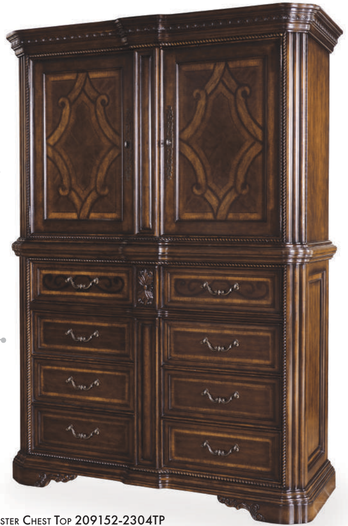
MASTER CHEST TOP 209152-2304TP 65"W x 25"D x 42"H