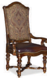
ARM CHAIR 209205-2304 28 1 / 8 "w x 27" d x 50 1 / 2 " H Pages 2,3,13,14,15