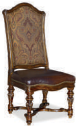
SIDE CHAIR 209204-2304 23 1 / 4 "w x 27" d x 49" H Pages 2,3,13,14,15