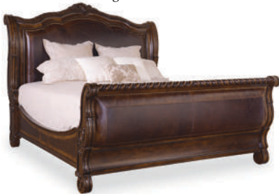
5/0 UPHOLSTERED SLEIGH BED 209155-2304 5/0 HB 67½"W x 19 1 / 8 "D x 74 3 / 8 "H 5/0 FB 67"W x 13¼"D x 37¼"H 5/0-6/6 RS 76"W x 1 5 / 8 "D x 14"H