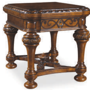
END TABLE 209303-2304 26"W x 31"D x 26"H