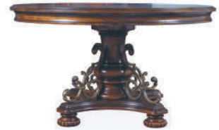
ROUND DINING TABLE 209224-2304 54"W x 54"D x 30"H Pages 15