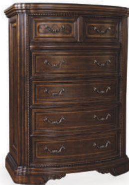
DRAWER CHEST 209150-2304 46"W x 22½"D x 60½"H Pages 7