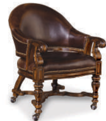
CASTER CHAIR 209216-2304 26 1 / 8 "w x 28 3 / 8 " d x 36" H Pages 22,23