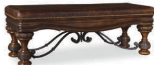
STORAGE BED BENCH 209148-2304 54¼"W x 20¼"D x 19"H Pages 5,10