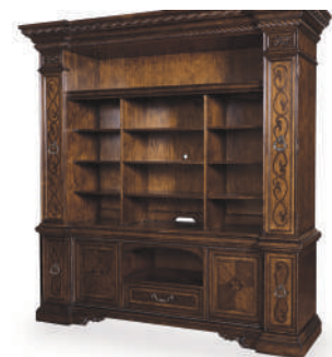
ENTERTAINMENT CENTER TOP 209424TP 93" w x 27 1 / 4 " d x 64 3 / 8 " H