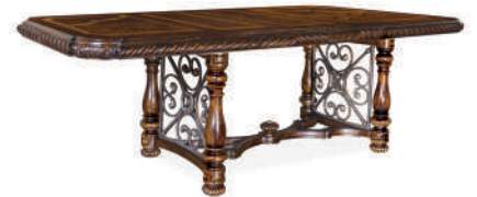
GATHERING HEIGHT TABLE 209226-2304 45 3 / 8 "W x 76 3 / 8 "/116 3 / 8 "D x 36"H Extends to 116 3 / 8 " With 2-20" leaves. Pages 3,16,17