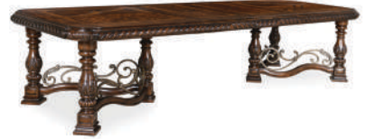
TRESTLE DINING TABLE 209221-2304 50"W x 86/130"D x 30"H Extends to 130" Includes two 2-22" leaves. Pages 12,13