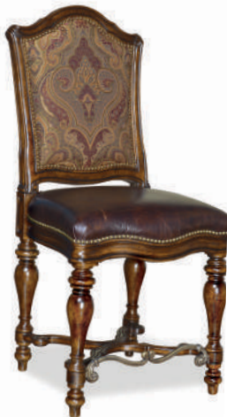
GATHERING HEIGHT CHAIR 209208-2304 23¼" w x 25 ⅝" d x 49¼" h