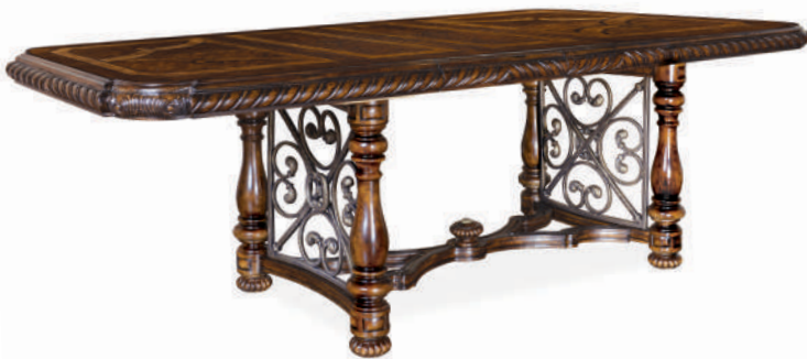
GATHERING HEIGHT TABLE 209226-2304TP/BS 45⅜" w x 76⅜" / 116⅜" d x 36" h Extends to 116⅜" With 2-20" leaves.