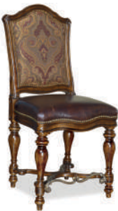
GATHERING HEIGHT CHAIR 209208-2304 23 1 / 4 "w x 25 5 / 8 " d x 49 1 / 4 " H Pages 3, 16,17