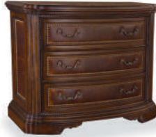
ACCENT DRAWER CHEST 209151-2304 50"W x 22½"D x 40"H Pages 10