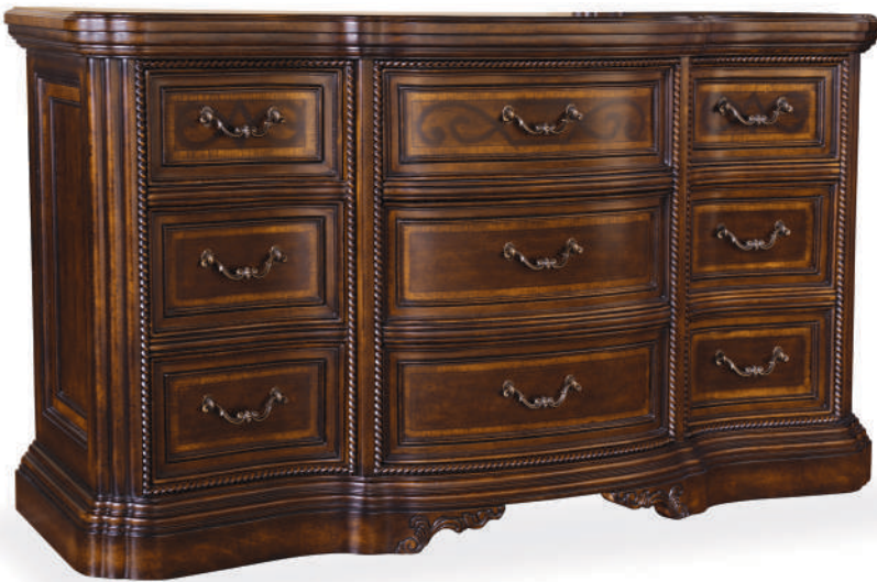
DRESSER 208130-2304 76"W x 23½"D x 41"H