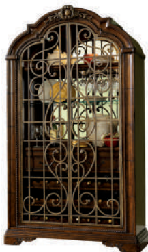
WINE CABINET 209242-2304 54 1 / 2 "w x 20 5 / 8 " d x 91 7 / 8 " H Pages 3,12,15, 16,17, 18