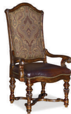
ARM CHAIR 209205-2304 28⅞"W x 27"D x 50½"H